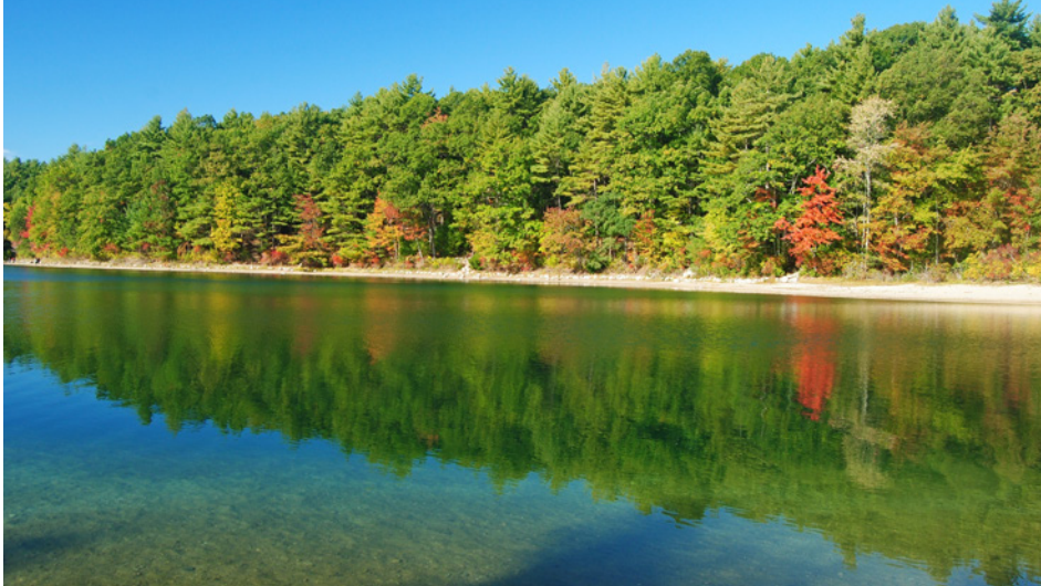
Blue Springs® Lake and Pond Colorant beautifies cloudy water with a pleasing blue color.