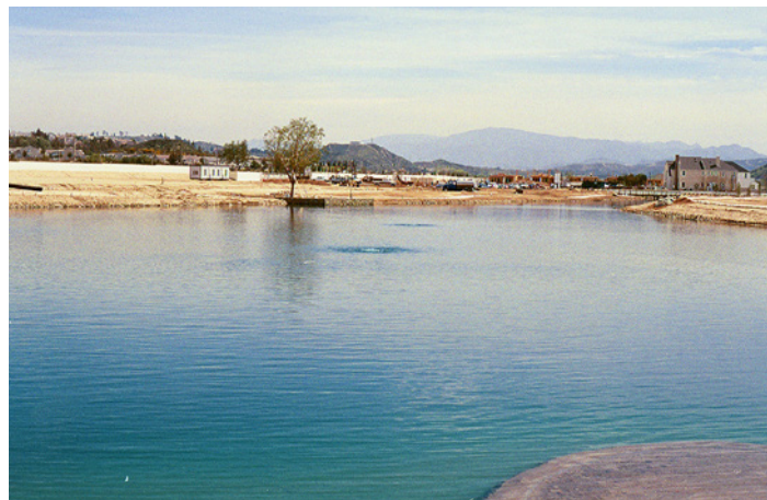
For use in lakes, ponds, and decorative water features with little or no overflow.

Lonza Water Treatment is a leader in specialty chemicals. For over 45 years, Applied Biochemists® products have improved the recreational and functional value of water in many use sites.